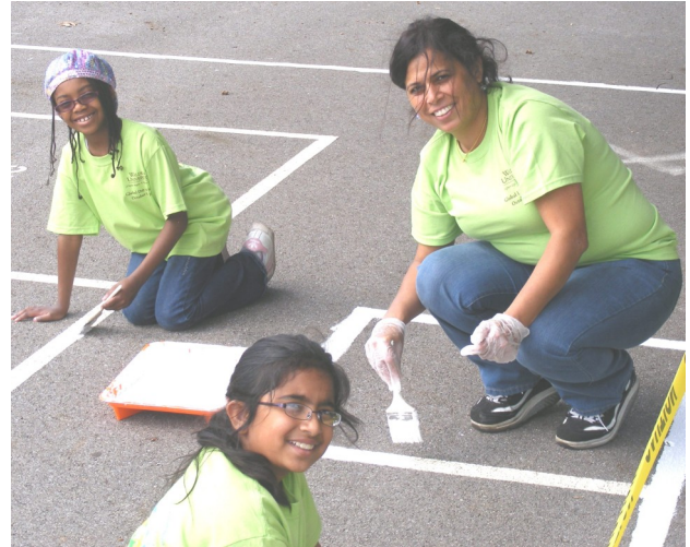
Adults and children came out to volunteer for the 7th Annual Global Day of Service. Pictured are three participants associated with Walden University.

The information listed on the university's website indicates that the institution was founded in 1970 by two teachers who wanted to find a way for working adults to pursue their doctoral degrees. Walden now offers bachelor, masters, doctoral degrees, and certificates. They are a full-service organization that