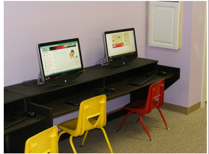
Computer room at the Maryland Montessori Academy

are veteran Montessori educational training. For young students, there is a premium placed on hands-on learning and (Continued on Page 11)